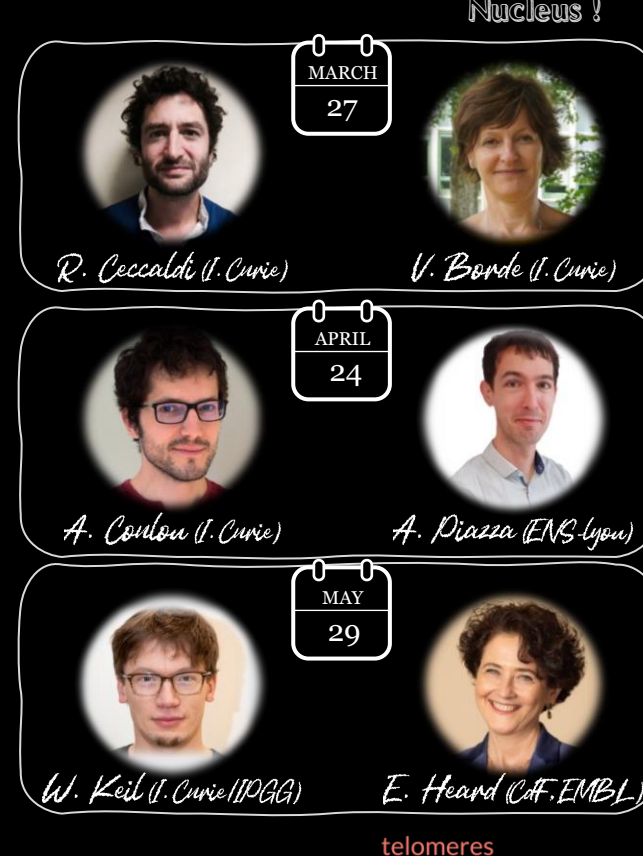
dna-methylation non-coding single-molecule silencing repair development single-cell imaging transcription genomics transponse compartmentalization meiosis